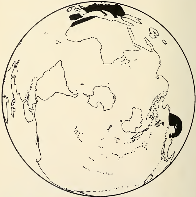
Fig. 4. Distribution of the living members of the family Discoglossidae.

Discoglossidae. Today represented by four living genera, this family shows a typical relict distribution: Bombina in Europe and eastern Asia; Discoglossus in Europe and northern Africa; Alytes